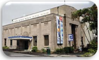
Pacific Tsunami Museum