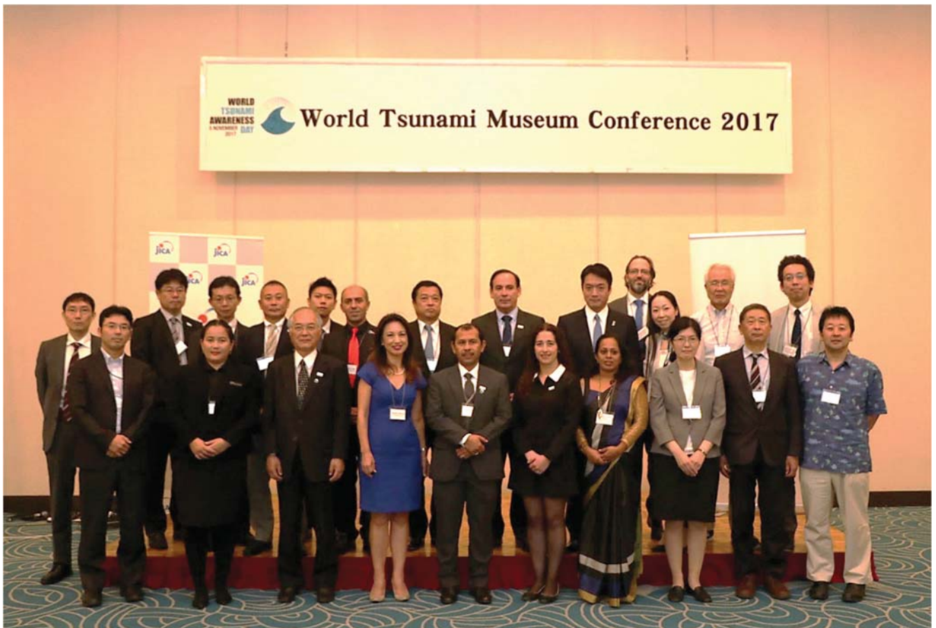
Group photo of the World Tsunami Museum Conference