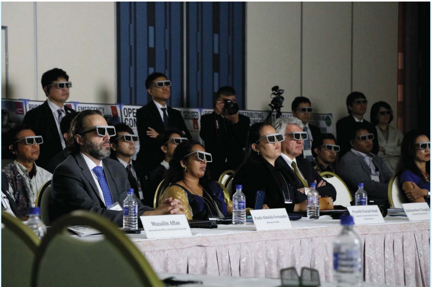
Participants are watching the 3D movie wearing special glasses.