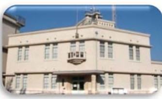
Hiroshima City Ebayama Museum of Meteorology