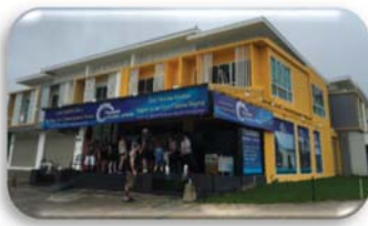
International Tsunami Museum