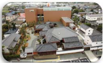
Inamura-no-Hi no Yakata