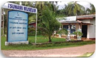
Community Tsunami Education Centre and Tsunami Museum