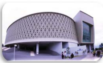
Aceh Tsunami Museum

Banda Aceh, Indonesia Established in 2009