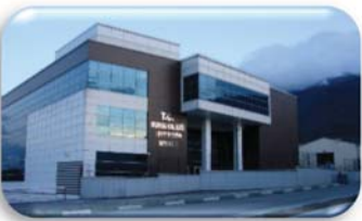
Bursa Disaster Training Center