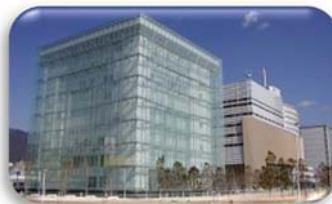
Disaster Reduction and Human Renovation Institute