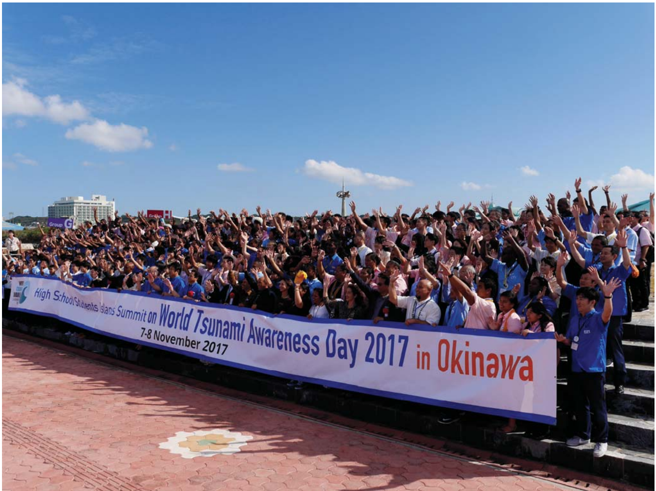
High School Students gather in Ginowan City, Okinawa Prefecture, Japan

The High School Students Islands Summit for World Tsunami Awareness Day 2017 was held in Ginowan City, Okinawa Prefecture, Japan, from 7-8 of November 2017, two days after the World Tsunami Museum Conference. This was the second summit following the first one in 2016, which was held in Kuroshio city, Kochi Prefecture. 255 high school students from 26 countries attended the Summit, including countries where participants of the World Tsunami Museum Conference are from: Chile, Indonesia, Japan, Sri Lanka, Thailand, and United States.