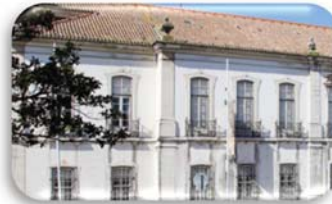
Museum of Lisbon

Banda Aceh, Indonesia Established in 2009